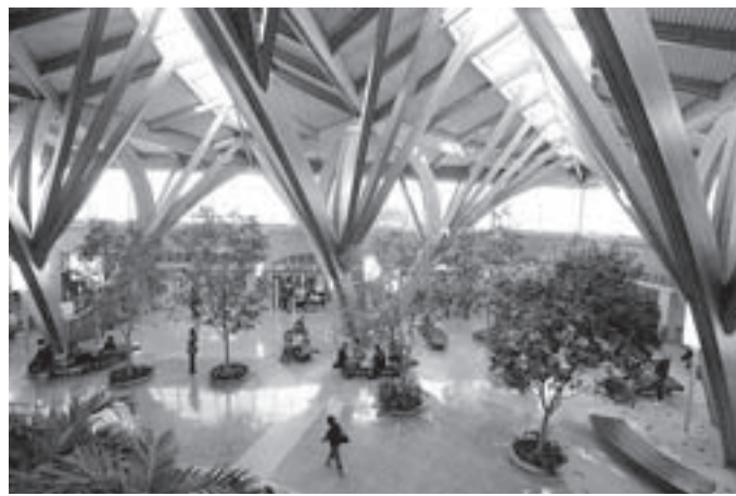
Credit Valley's main lobby welcomes visitors with beams that spread through the space like a dense forest.

Once selected, the consortium will hire its own architects to actually construct what's in the binders. And this is where myriad problems with the building can go wrong. To save on costs, a window might be made smaller, even though it blocks the view for a patient sitting in a wheelchair. An atrium