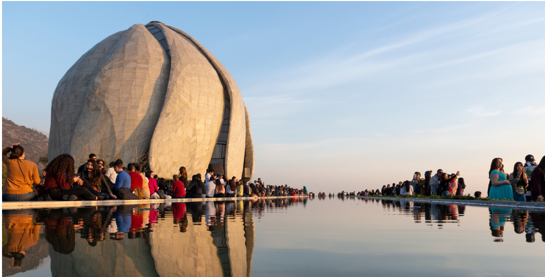
Bahá'í Temple of South America by Hariri Pontarini Architects

A strong architectural community that is valued and empowered to create change.