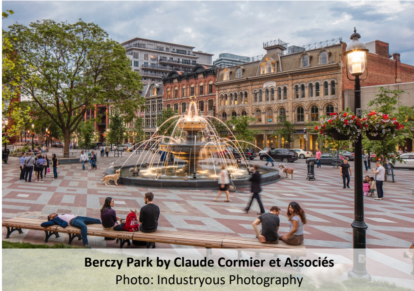
Berczy Park by Claude Cormier et Associés