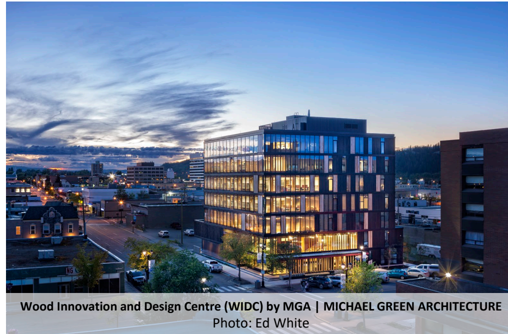
Wood Innovation and Design Centre (WIDC) by MGA | MICHAEL GREEN ARCHITECTURE

The RAIC provides Canada's architectural community with the tools, resources, advocacy, and education that will elevate their practice and help create a better future for people and the planet.