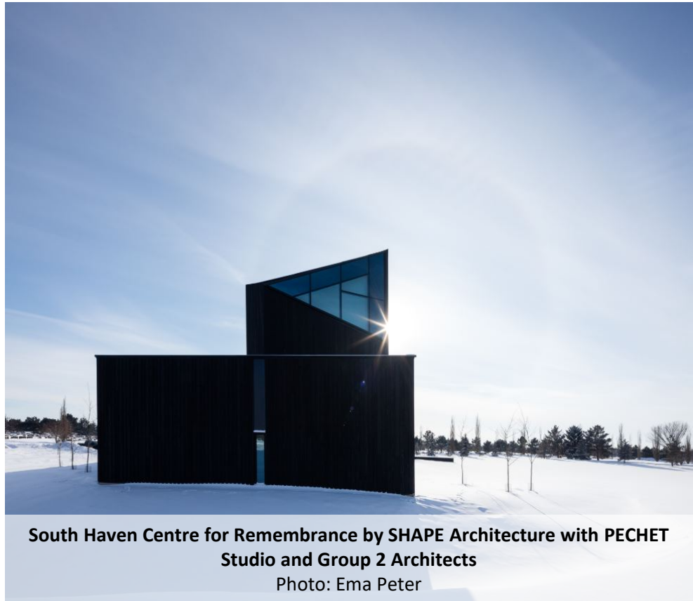
South Haven Centre for Remembrance by SHAPE Architecture with PECHET Studio and Group 2 Architects