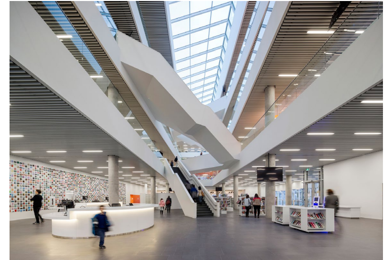
Halifax Central Library by Fowler Bauld & Mitchell Ltd. / schmidt hammer lassen architects

Strengthen, engage and celebrate the architectural community