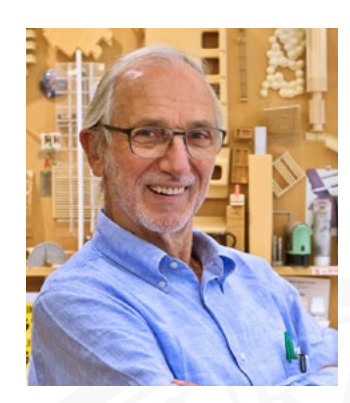
Renzo Piano Hon. FRAIC