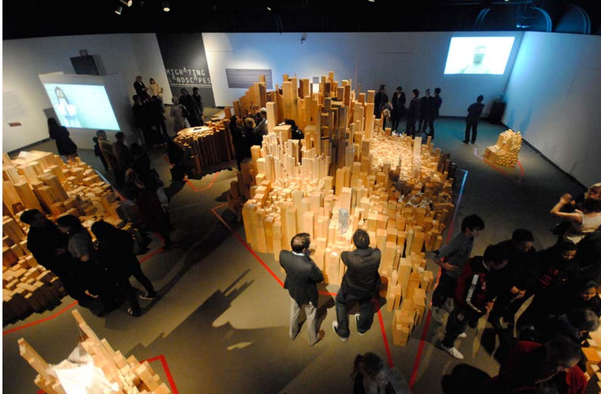
Regional Exhibition of "Migrating Landscapes" at the Museum of Vancouver