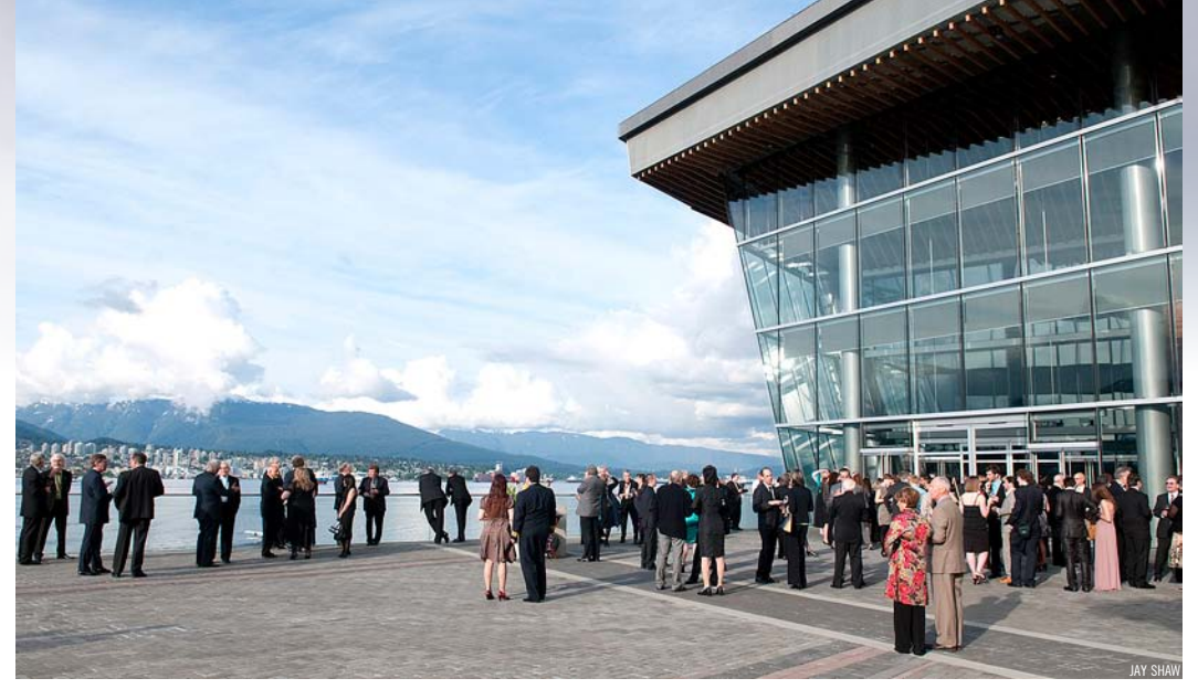
Presidents' gala and reception at the Vancouver Convention Centre | Architect (expansion): Musson Cattell Mackey Partnership Architects Designers Planners, Downs/Archambault & Partners, LMN Architects