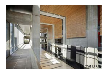
FOR OFFICE BUILDING INNOVATION – HONOURABLE MENTION Manitoba Hydro Place Kuwabara Payne McKenna Blumberg Architects, Smith Carter Architects and Engineers, Prairie Architects Inc. (Toronto, ON)