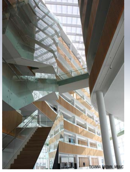
Aller Building, Copenhagen, Denmark Architect: PLH Architects

The Danish Consulate General, The Danish Architectural Association and Architecture Canada have tailored Sustainable Architecture and Green Buildings in Co2penhagen , a Continuing Education program and tour of new and sustainable architecture in Denmark for RAIC members.