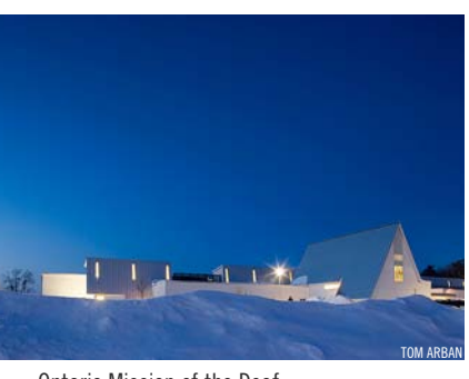
Ontario Mission of the Deaf

Montgomery Sisam Architects Inc. was the recipient of the 2011 Architectural Firm Award. In bestowing the award, the Selection Committee noted: