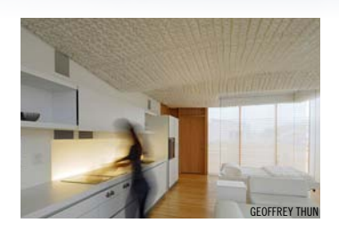
FOR PRACTICE OF ARCHITECTURE North House: Responsive Envelope System RVTR Inc. / Team North (Toronto, ON)