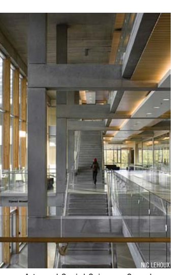
Arts and Social Sciences Complex -SFU | Architect: Perkins+Will Canada

As a result of RAIC's participation in FIRPAC, subsequent meetings with Defence Construction Canada as well as SNC Lavalin O & M were arranged to discuss procurement and contract issues in greater detail. Progress and understanding with each of these client organizations is an ongoing process.