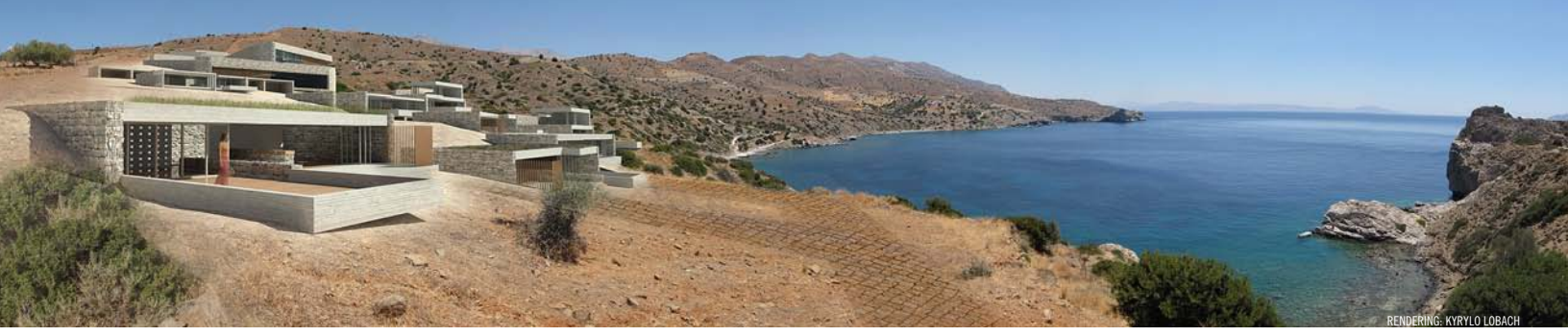
Agios Pavlos Yoga Centre & Villas (Crete, Greece) | Design: Taymoore Balbaa Design Studio (TABA)