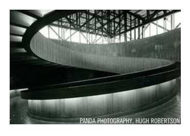
Ottawa Train Station | 1966 Ottawa, ON Architects: John B. Parkin Architects (Successor Firm, NORR Limited)