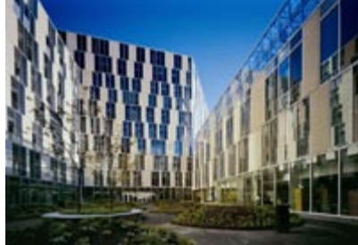
Pierre Dansereau Science Complex, Université du Québec à Montréal