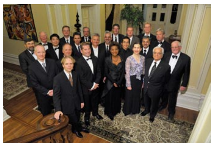
Her Excellency and the recipients of the 2008 Governor General's Medals in Architecture

The Governor General's Medals in Architecture recognize outstanding achievement for the "art" of architecture in recently built projects by Canadian architects. This program, created by the RAIC,