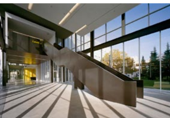
Communication, Culture and Technology Building - University of Toronto Mississauga

Communication, Culture and Technology Building – University of Toronto Mississauga