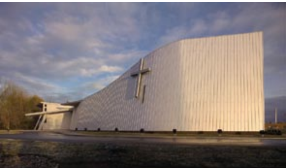
Scarborough Chinese Baptist Church