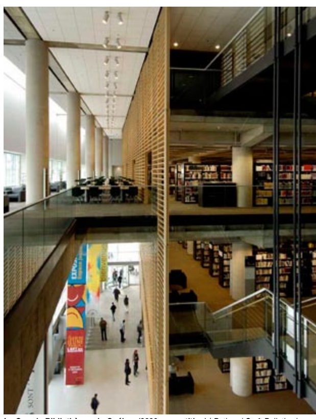
La Grande Bibliothèque du Québec (2000 competition) | Patkau / Croft Pelletier / Menkes Shooner Dagenais Associated Architects

All the information on the website was reviewed and it continually underwent maintenance and updates to ensure accuracy and relevance.