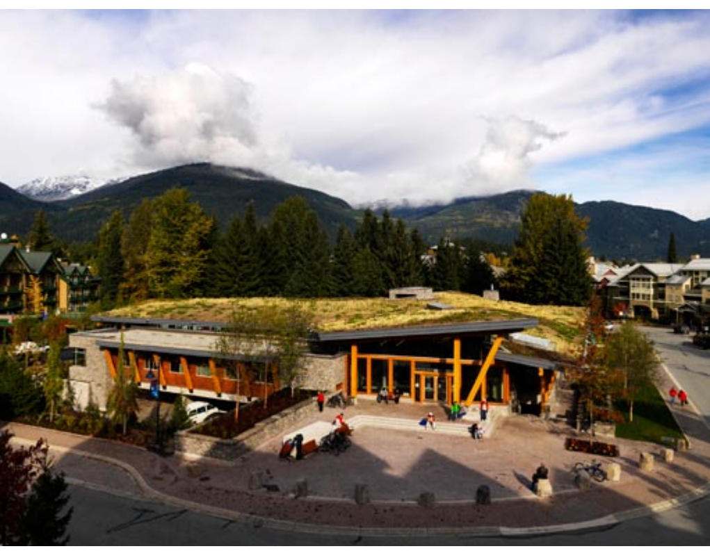
Whistler Public Library | Hughes Condon Marler: Architects