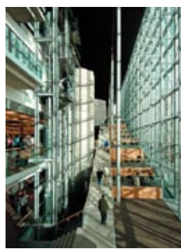
Winnipeg Centennial Library Addition