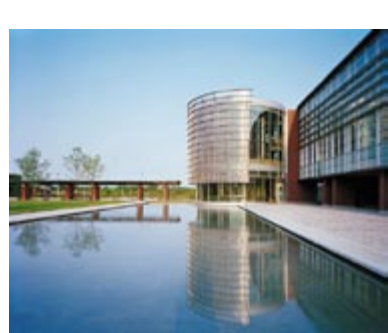
University of Ontario Institute of Technology