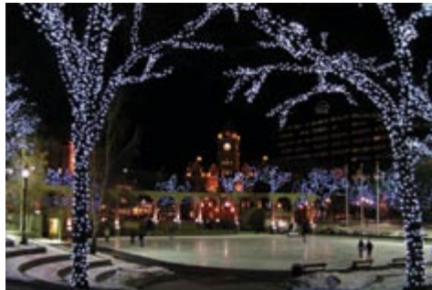
Calgary Starts Here: Olympic Plaza Cultural District Strategy