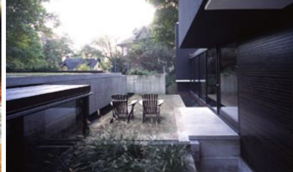
Gleneagles Community Centre | photo: House at 4a Wychwood Park