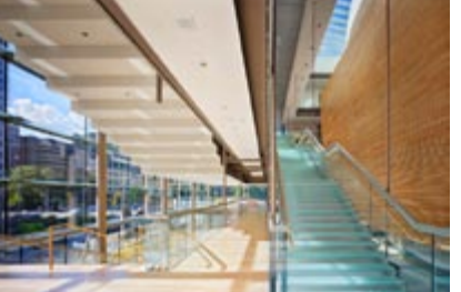
Four Seasons Centre for the Performing Arts