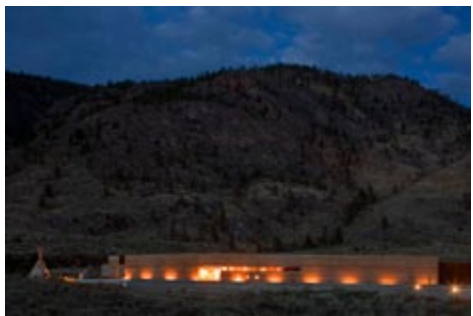
Nk'Mip Desert Cultural Centre