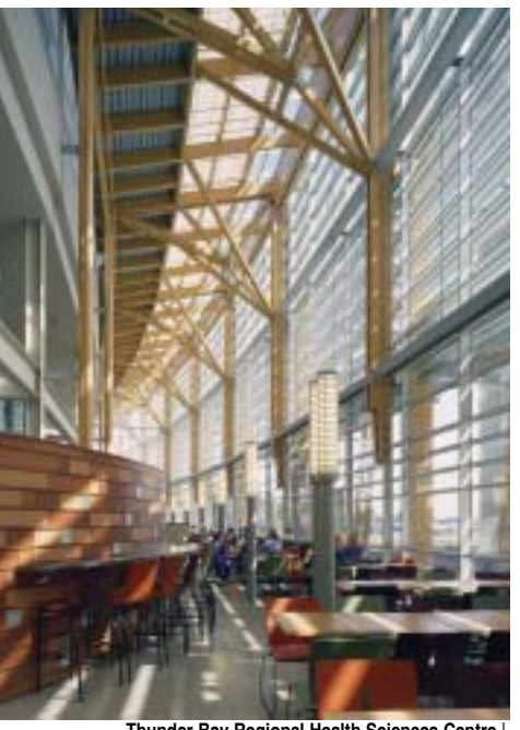
Thunder Bay Regional Health Sciences Centre | Salter Farrow Pilon Architects Inc.

Scientists tell us that in order to avoid dangerous climate change we must keep global warming under 2°C above pre-industrial levels. We are currently at 0.7°C above pre-industrial levels.