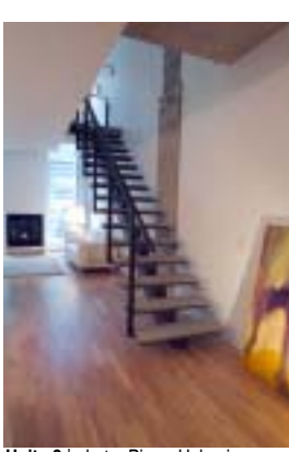
Unity 2