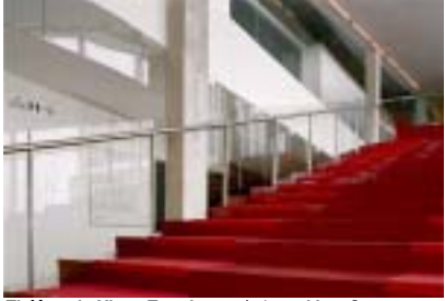
Théâtre du Vieux-Terrebonne