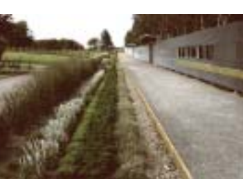
Structures d'accueil des Jardins de Métis