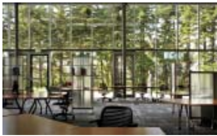
SC3-Smith Carter Workplace