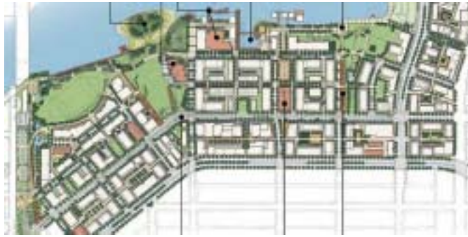
Southeast False Creek Public Realm Plan