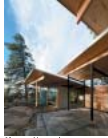
Maurer House