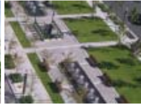
Quartier international de Montréal