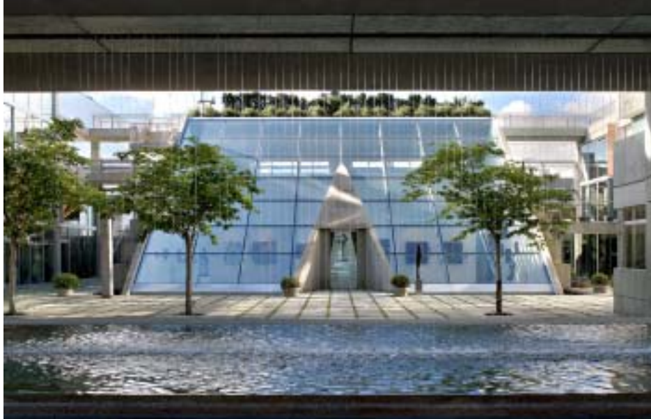
Waterfall Building | Arthur Erickson with Nick Milkovich Architects Inc.