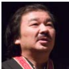
Shigeru Ban, Hon. FRAIC