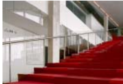
Théâtre du Vieux-Terrebonne