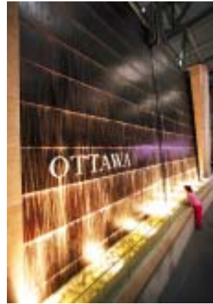
Ottawa Airport Water Feature