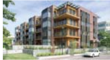
The South Circle Building

Community Improvement Projects – TSA Guide Map: Toronto Architecture 1953-2003 Toronto Society of Architects Map Committee