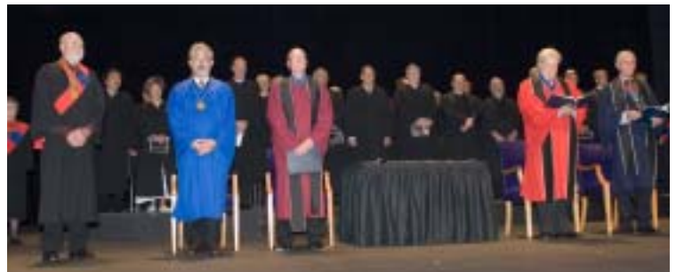
2006 College of Fellows Convocation Ceremony

The Chancellor and the National Committee of the College of Fellows administer the affairs of the College of Fellows and act as the Trustees of the RAIC Foundation.