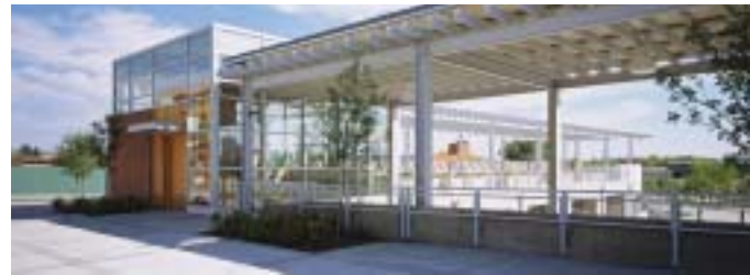
Bow Valley Centre Masterplan