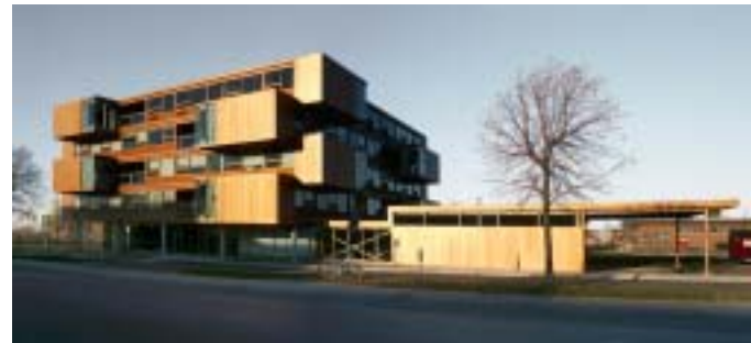
115 Studios – Cirque du Soleil