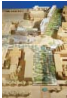
UBC University Boulevard

Brière, Gilbert + associés, architectures et design urbain