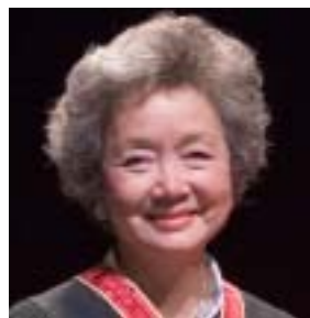
The Right Honorable Adrienne Clarkson, Hon. FRAIC