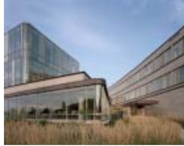
Schulich School of Business