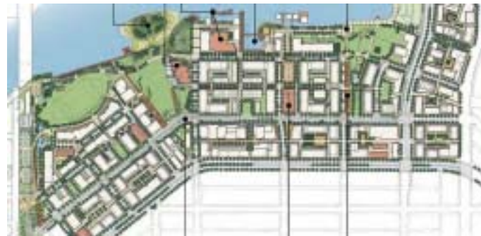
Southeast False Creek Public Realm Plan