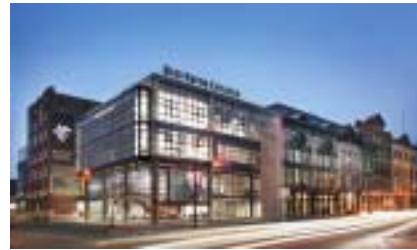
Red River College, Princess Street Campus