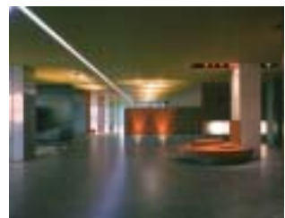
Institut de tourisme et d'hôtellerie du Québec