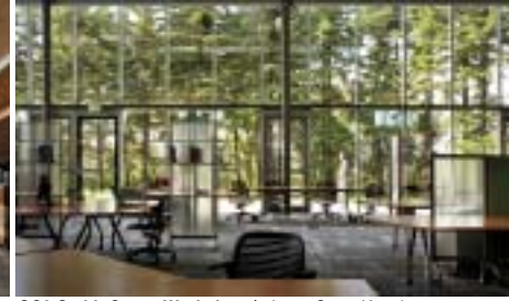
SC3-Smith Carter Workplace

SC3-Smith Carter Workplace Smith Carter Architects and Engineers Incorporated (Winnipeg, Manitoba)