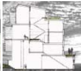
Urban Garden Live + Work