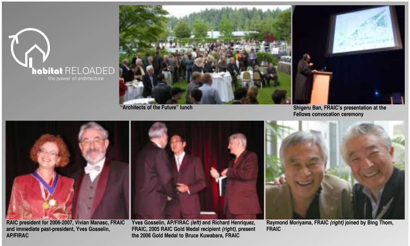
"Architects of the Future" lunch