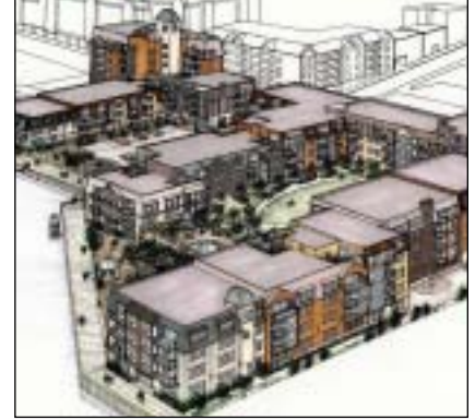
Bishop's Landing Development | Lydon Lynch Architects Ltd

A brief on the federal budget, funding for infrastructure and fiscal imbalance was submitted to the Minister of Infrastructure Canada, the Hon. Lawrence Cannon. The brief was followed by a presentation during a consultation meeting with the Minister. Among other recommendations, the RAIC stressed the importance of ensuring all federally funded projects are sustainable and demonstrate architectural quality and contribute to positive urban design.