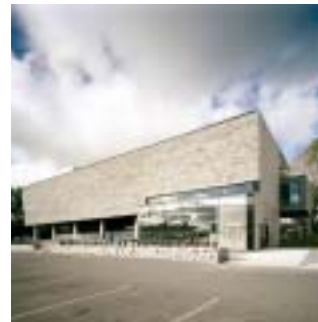
Bibliothèque Municipale de Châteauguay