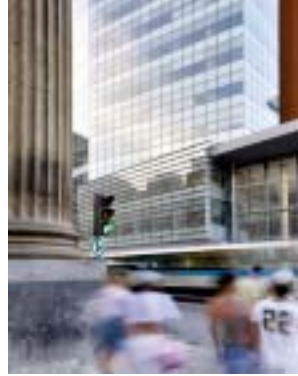
Le Quartier Concordia Phase 1

Kuwabara Payne McKenna Blumberg Architects / Fichten Soiferman Associés Architectes, in joint venture