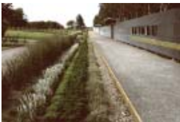
Structures d'accueil des Jardins de Métis