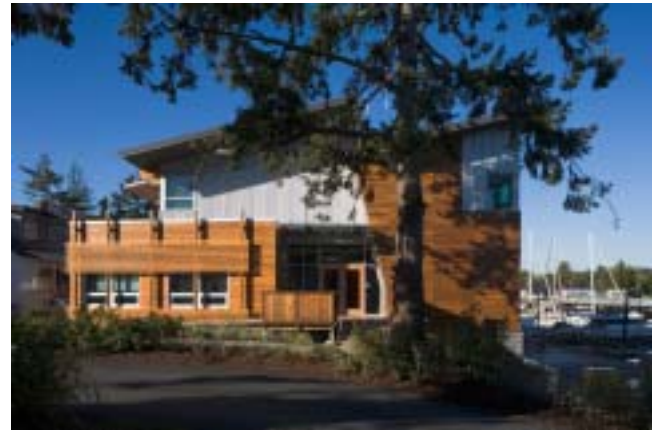
Operations Centre: Gulf Islands National Park Reserve (LEED Canada Platinum) | Larry McFarland Architects Ltd.

We will challenge government to consider tax incentives. Imagine if all buildings designed to 50 per cent less energy than the Model National Energy Code of Canada for Buildings received full GST rebates. That would get results very quickly, especially in this day of P3 and lease-financed public and private buildings.