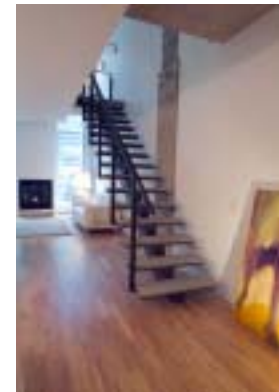
Unity 2

Unity 2 Cormier, Cohen, Davies architectes (Atelier Big City) (Montreal, QC)