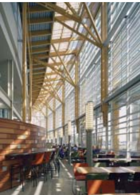
Thunder Bay Regional Health Sciences Centre | Salter Farrow Pilon Architects Inc.

Scientists tell us that in order to avoid dangerous climate change we must keep global warming under 2°C above pre-industrial levels. We are currently at 0.7°C above pre-industrial levels.