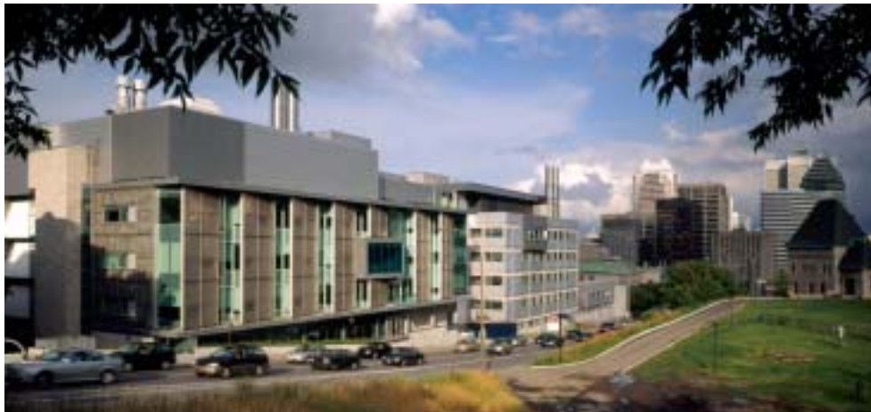
McGill University and Genome Quebec Innovation Centre | Kuwabara Payne McKenna Blumberg Architects, Fichten Soiferman et Associés, Architectes architects in joint venture