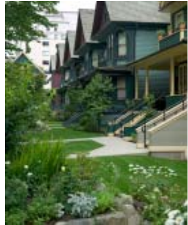
Mole Hill Housing Project