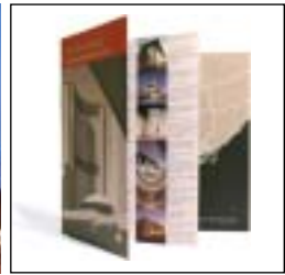
TSA Guide Map