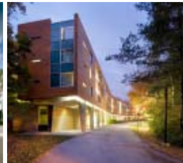
Erindale Hall | photo: Tom Arban