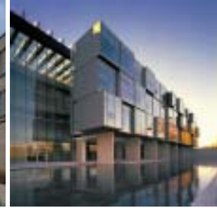
The Perimeter Institute