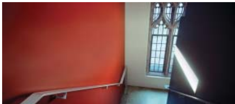
James Stewart Centre for Mathematics, McMaster University / Kuwabara Payne McKenna Blumberg Architects

I am also pleased to report that we were active with our other industry partners. We continue to work tirelessly with the Association of Consulting Engineers of Canada (ACEC) on better procurement methods for architectural and engineering services within the Federal Government. Once again this year the RAIC worked jointly to arrange a very successful event on Parliament Hill with ACEC, the Canadian Construction Association (CCA), BOMA Canada, and Construction Specifications Canada (CSC) and the Canada Green Building Council (CAGBC).