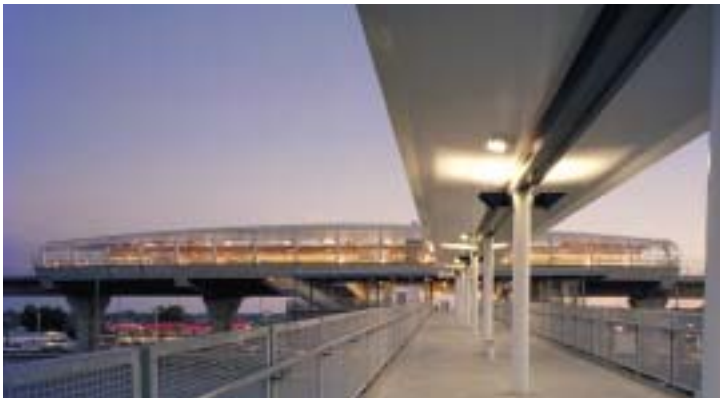
Brentwood SkyTrain Station / Busby + Associates Architects