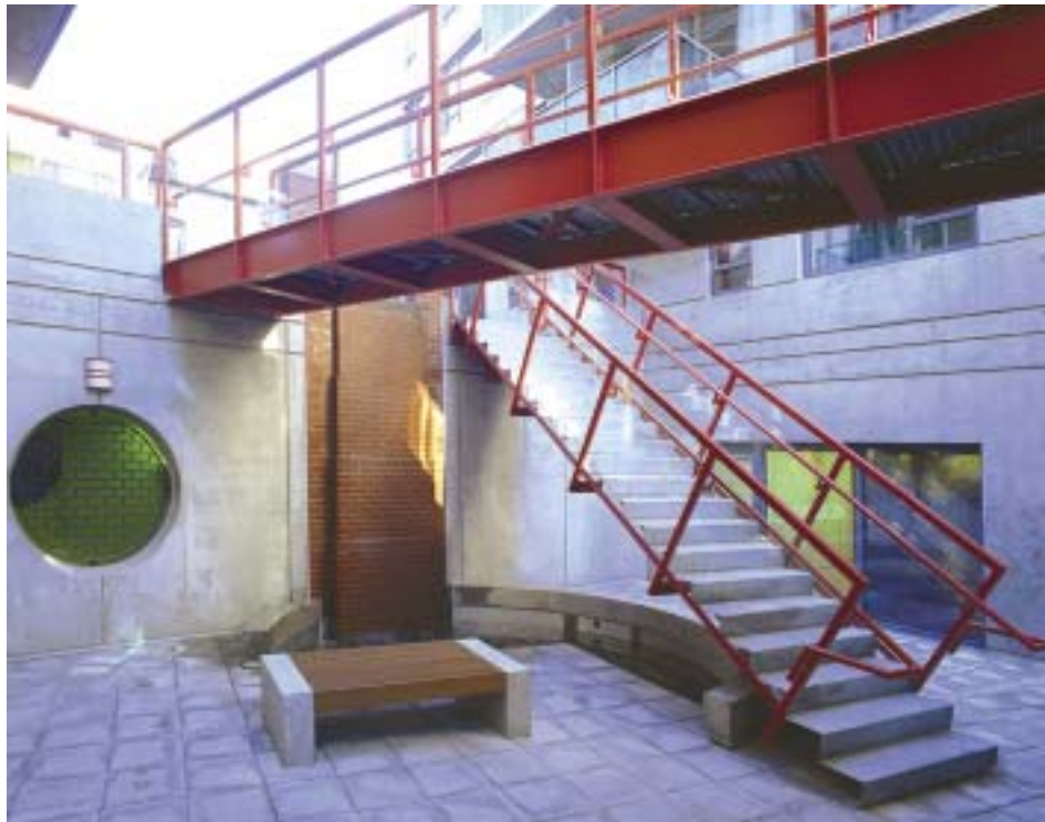
Lore Krill Housing Co-op / Henriquez Partners Architects