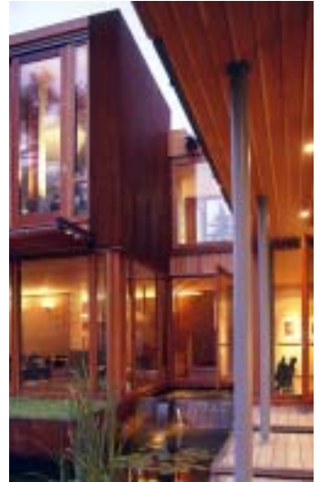
Steel Clad House / Shim-Sutcliffe Architects