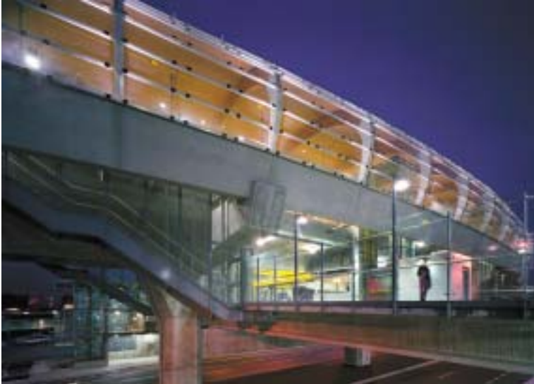
Brentwood SkyTrain Station / Busby + Associates Architects