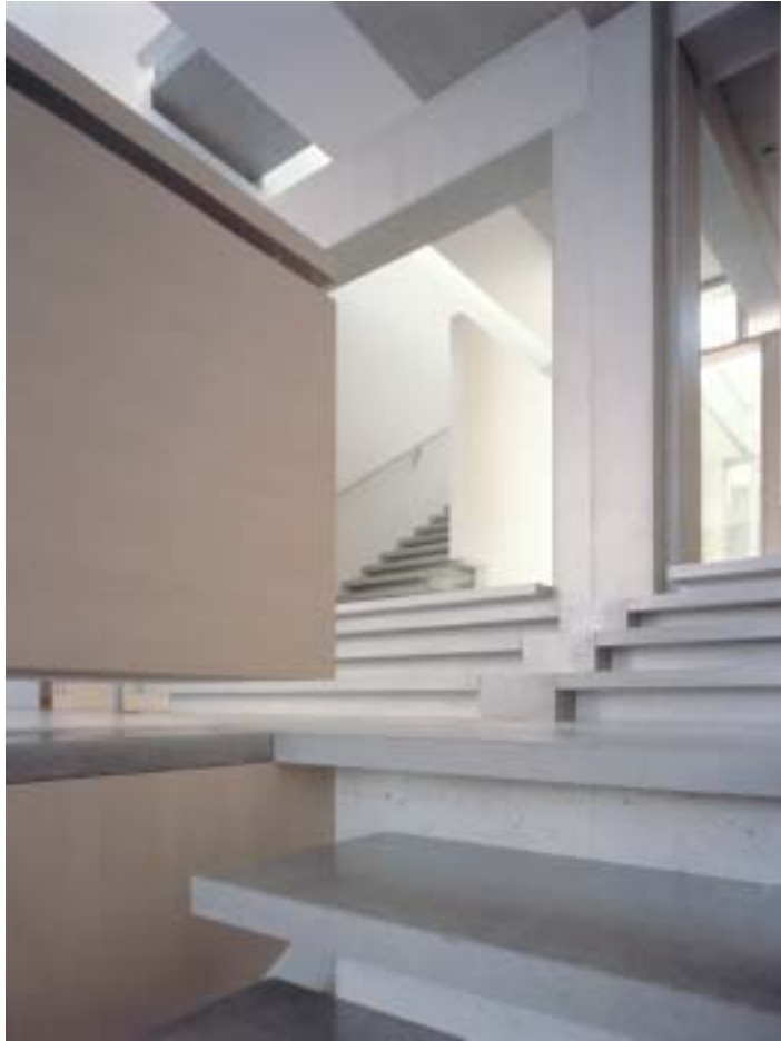
Shaw Residence / Patkau Architects Inc.