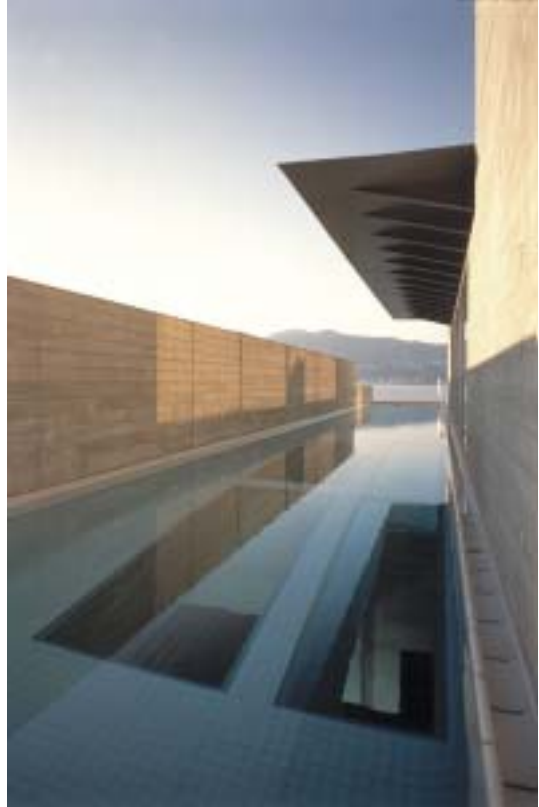
Shaw Residence / Patkau Architects Inc.