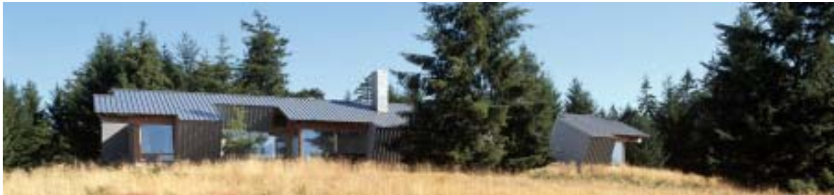
Agosta House / Patkau Architects Inc.