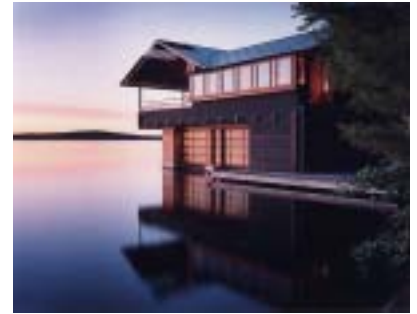
Muskoka Boathouse / Shim-Sutcliffe Architects

As part of its mission, the RAIC provides the national framework for the development and recognition of excellence. In doing so the RAIC embraces regional, national and international activities in support of architecture in Canada.