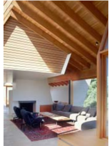
Agosta House / Patkau Architects Inc.