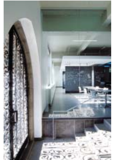
James Stewart Centre for Mathematics, McMaster University / Kuwabara Payne McKenna Blumberg Architects