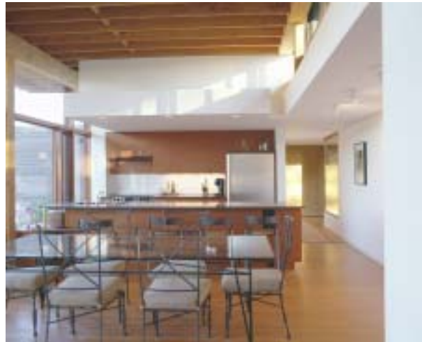
House in Erin / Ian MacDonald Architect Inc.